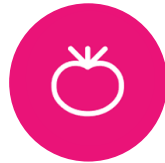
Vegetables & fruits