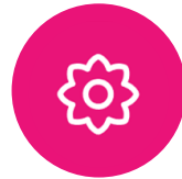
Ornamentals & spices